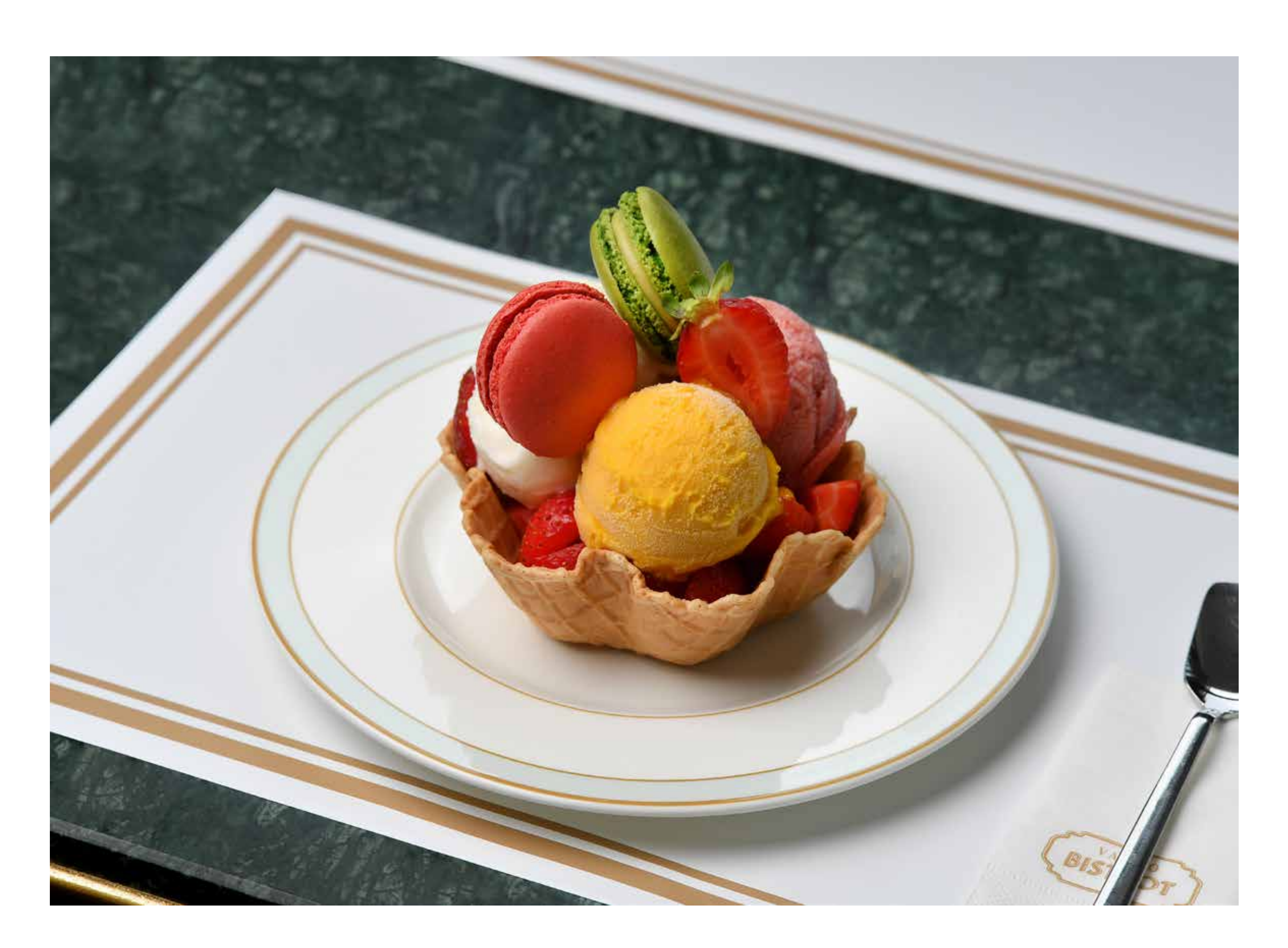
COUPE DE FRUITS

Strawberry, lemon and mango sorbet; with Vakko macaron and fresh strawberries