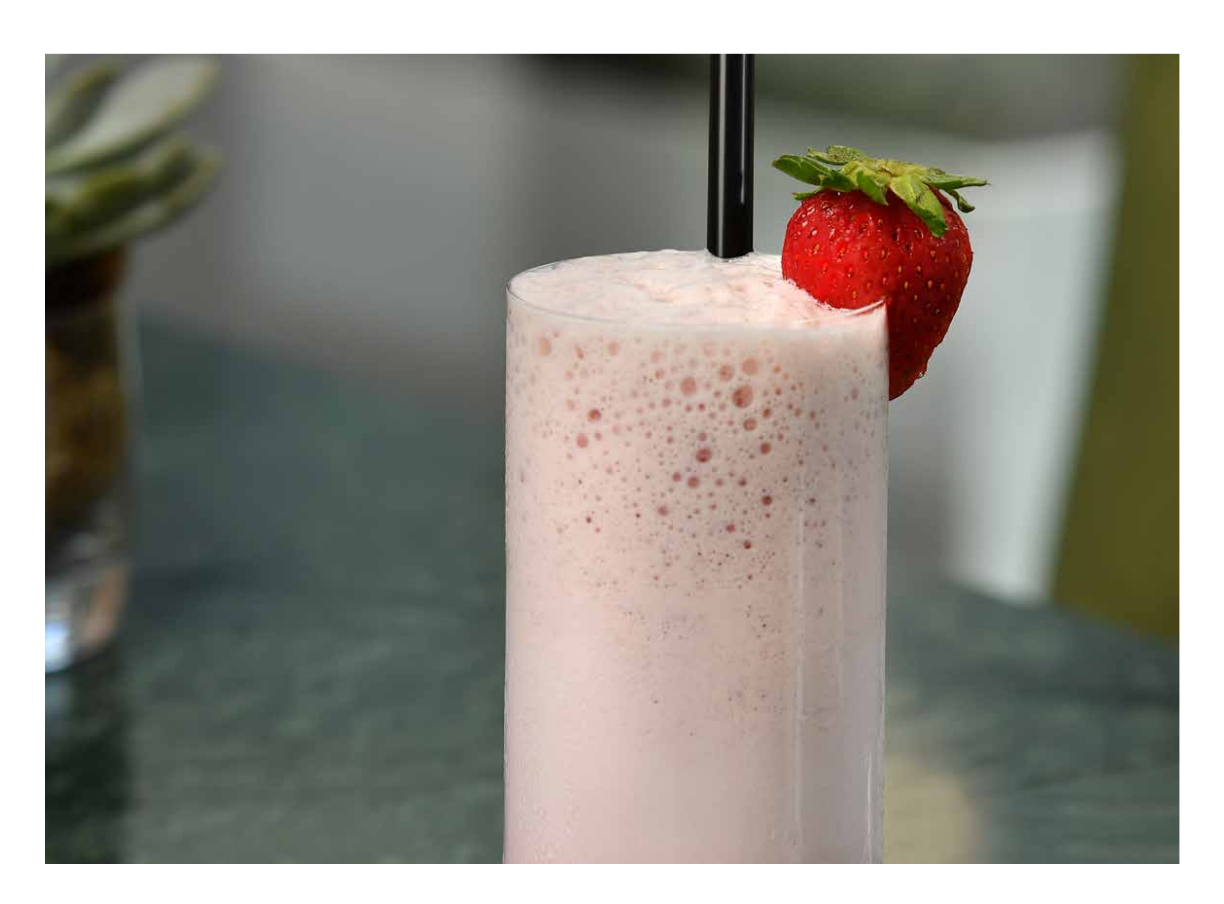
MILKSHAKE (With the type of ice cream you want)

Strawberry, lemon and mango sorbet; with Vakko macaron and fresh strawberries